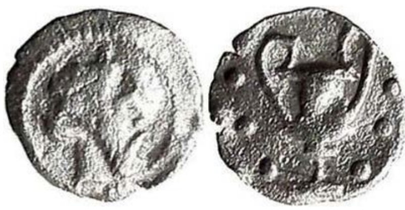
Kantharos; six pellets around (mark of value).