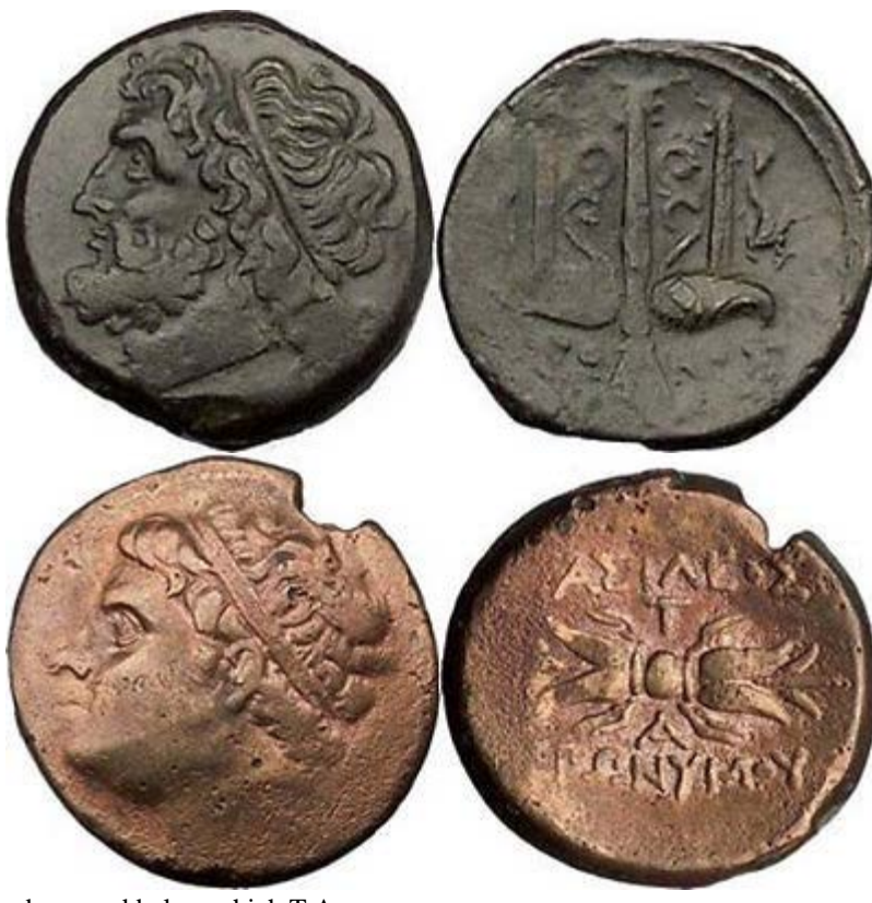
above and below which T A.

Head of Poseidon left, wearing tainia. Ornamented trident-head, between two dolphins, dividing IEP \Omega - NOS.